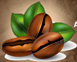
Arabica & Robusta Gayo, Bali, Toraja, West Java