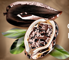
Grade A & B Nibs

Savor the richness with our premium coffee selections – Gayo Arabica, Robusta, Bali Arabica, Toraja Arabica, and West Java Arabica, along with exquisite cacao offerings, including cacao nibs, grade A, and grade B – a delightful symphony for coffee and chocolate enthusiasts.